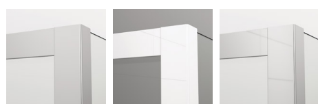
01 Silver matt 04 White 50 Silver gloss