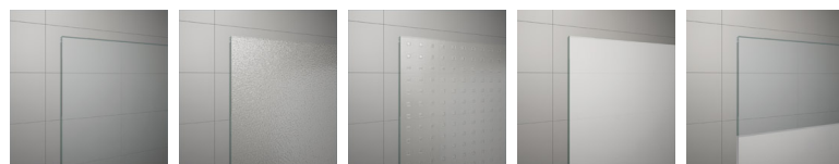
07 Clear 22 Graniet 30 Master Carré 49 Screenprinted satin 51 Screenprinted band