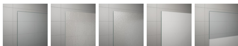
07 Clear 11 Acrylic glass 22 Graniet 49 Screenprinted satin 51 Screenprinted band