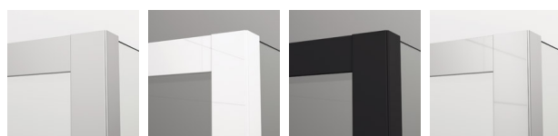
01 Silver matt