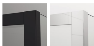
06 BLACK LINE