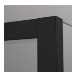
06 BLACK LINE